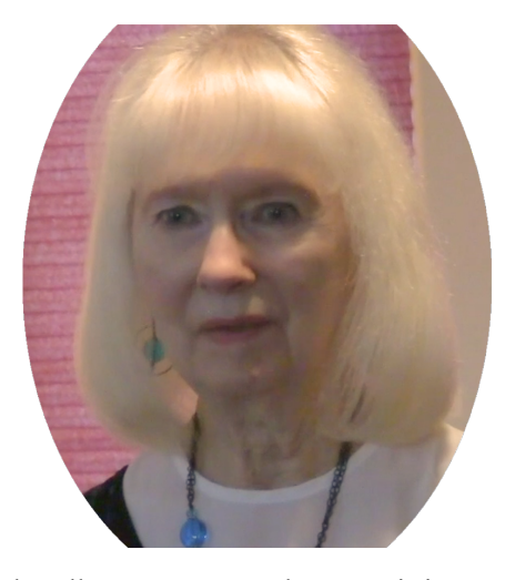
handle. But you can because it is you. And you are in that space and that time coming home in love.

When you are in that place and I know -- I have seen you touch that space and then wonder, "Oh, what is that?" And sometimes in the beginning, you will run from it because it seems too big, too much to